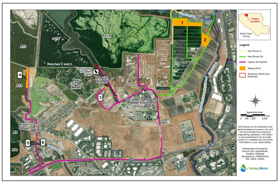
Figure 3. Previously described haul routes associated with the proposed action

be driving through the same industrial area (near the landfill), the number of truck trips would be the same, and the clarified route traversing a short segment of Grand Boulevard immediately adjacent to the EEC entrance does not involve any new roadways that are susceptible to traffic congestion. This clarified route would result in a negligible increase in transportation distance (0.71 miles) relative to the infeasible route, but would remain well within the increased hauling distances assumed in the 2020 SIR and therefore the air quality impacts have been evaluated and would remain the same. Moreover, all applicable best management practices (BMPs) and avoidance and minimization measures as prescribed in the 2015 IFR or 2020 SIR would remain the same and would be implemented with the clarified route. Therefore, USACE has determined that accessing the project site via the clarified route have been adequately analyzed in the project's existing NEPA documents.