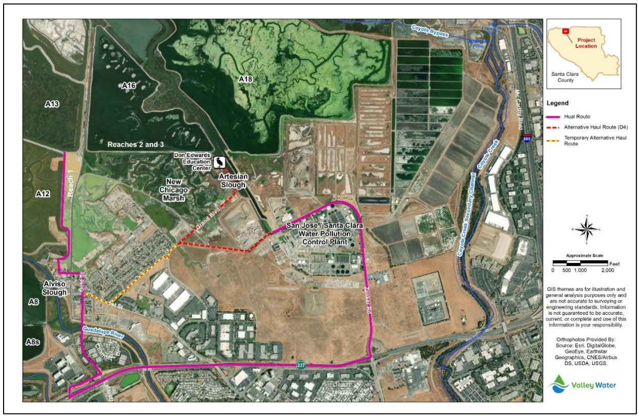
Figure 4. Additional alternative haul route along Grand Boulevard and North First Street.